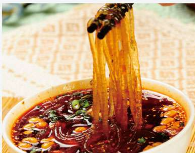
D12 酸辣粉 9.00 Hot & Sour Yam Noodle