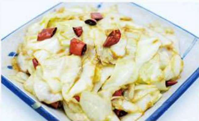
手撕包菜 14.00 Dry Stir Fried Cabbage with Pork Belly