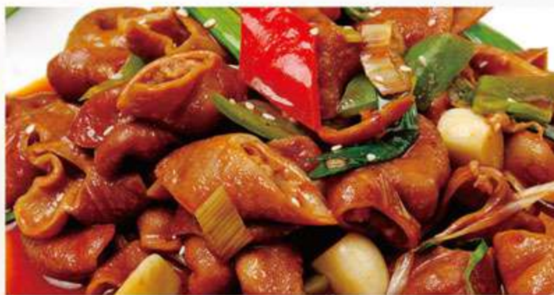
川喜大蒜烧肥肠 🌶️ 21.00

Tofu Pudding with Beef/Fish/Intestine in Sichuan Chili Oil Sauce, Topping Yellow Bean