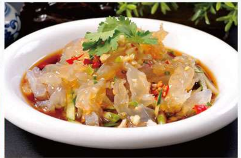
A3 凉拌海蜇 16.00 Jelly Fish Cucumber, Onion Salad