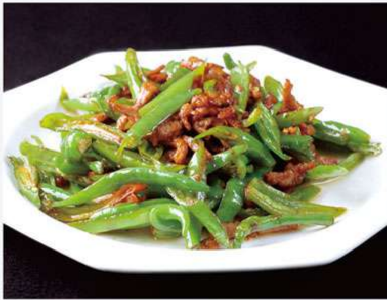
尖椒炒，肉丝/牛肉丝 🌶️ 16/20 Spicy Green Pepper Sauteed Shredded Pork / Beef