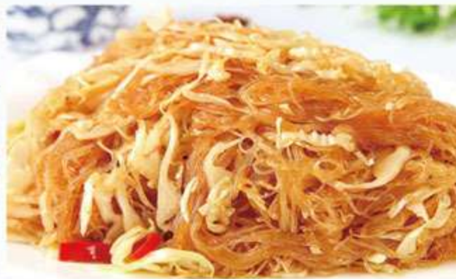
粉丝莲白 16.00 Thin Sliced Cabbage Stir Fired with Yam Noodle