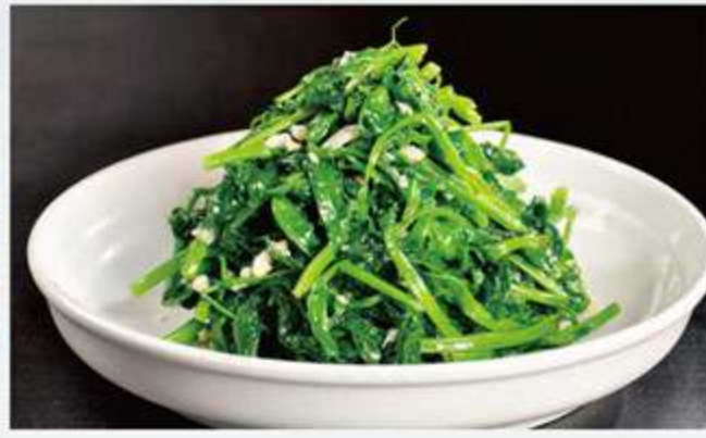
蒜茸豆苗 MP Sautéed Snow Pea Shot with Fresh Garlic