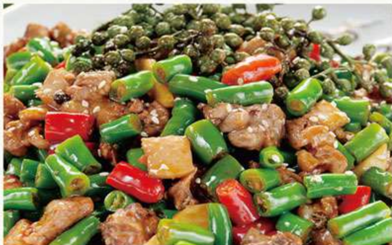
川喜花椒鸡 🌶️🌶️ 20.00 Sauteed Chicken with Green Pepper