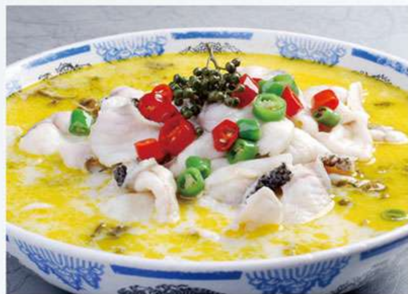
酸菜鱼(黑鱼片) 🌶️ 28.00

Boiled in Red Chili Sauce with Bokchoy, Bean Sprout, Garlic Shoot, Yuba, Potato