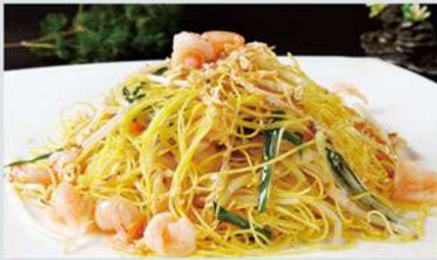
星洲炒米粉 13.00 Rice Noodle Pork/Chicken/Beef/Shrimp/Vegetable