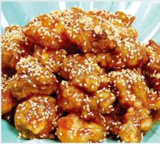
芝麻鸡 17.00 Sesame Chicken