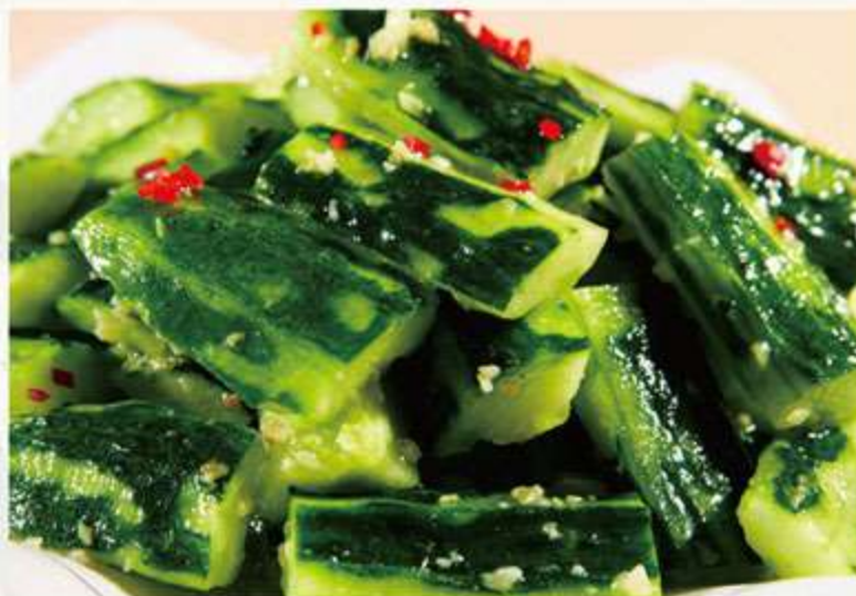
A9 脆口黄瓜 9.00 Crispy Cucumber Salad / Choice Spicy or Not