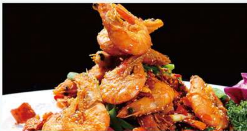
香辣 大虾/软壳蟹 🌶️ 23/32

Boiled Fish w/ Pickled Vegetable in Chili Sauce, Enoki Mushroom, Clean Noodle