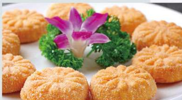
D9 南瓜饼 6.00 Fried Sweet Pumpkin Cake