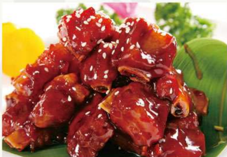
A8 糖醋小排 14.00 Sweet & Sour Spare Rib