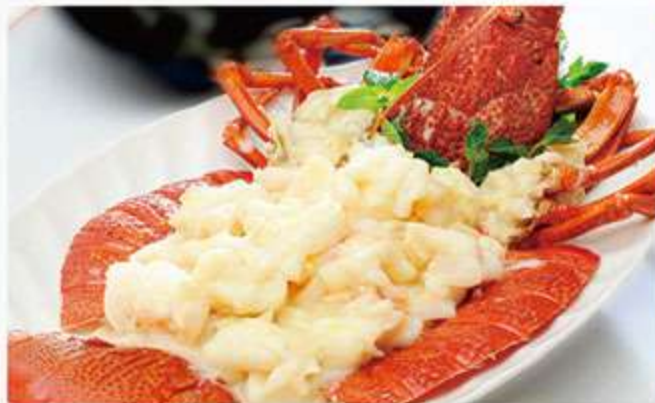
龙虾 姜葱/香辣 MP Loster with Ginger Scallion / Hot Spicy