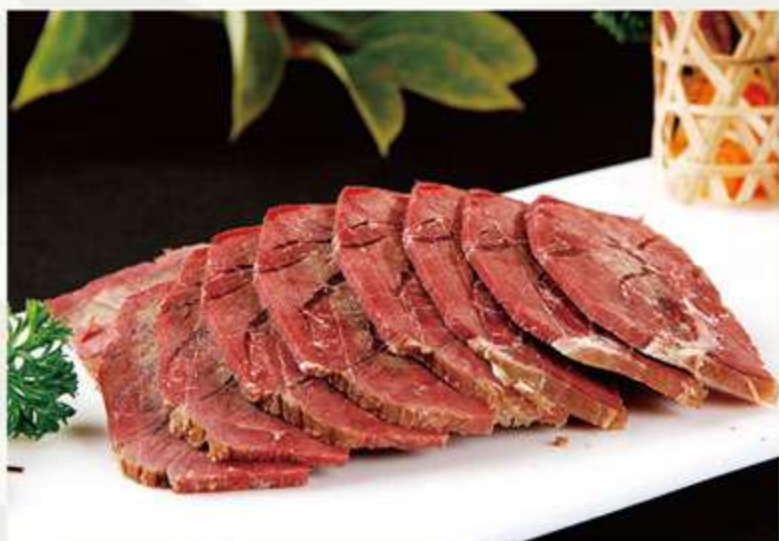
A6 五香牛肉 16.00 Five Spicy Beef