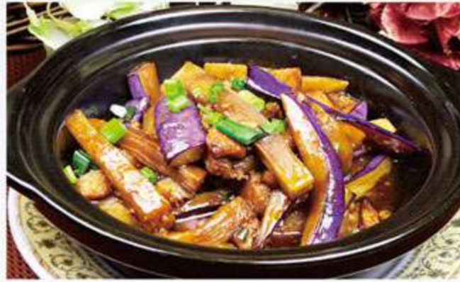
鱼香茄子 14.00 Chinese Eggplant with Garlic Sauce