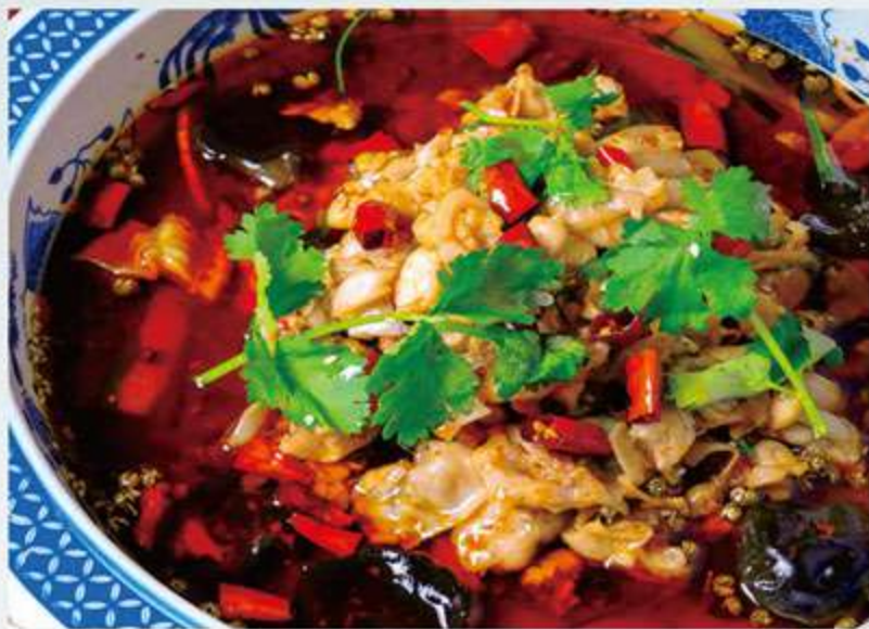
馋嘴田鸡 🌶️ 35.00