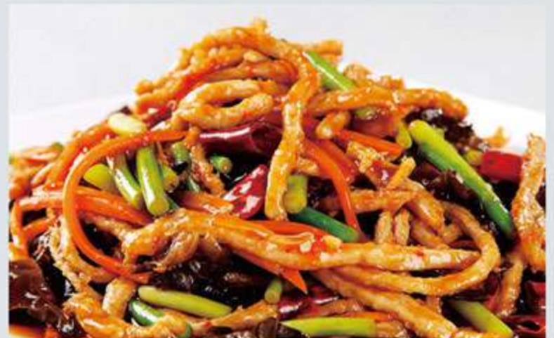
鱼香肉丝 17.00 Sauteed Shredded Pork with Garlic Sauce