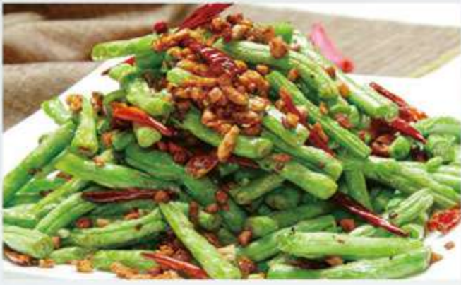
干煸四季豆 (含肉末) 14.00 Dry Stir Fried String Bean with Minced Pork