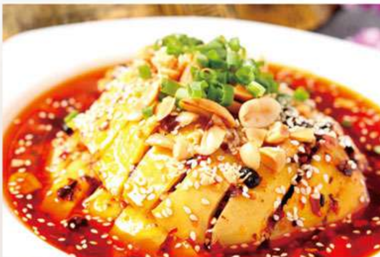
A4 口水鸡 🌶️🌶️ 14.00 Steamed Organic Chicken w. Sichuan Chili