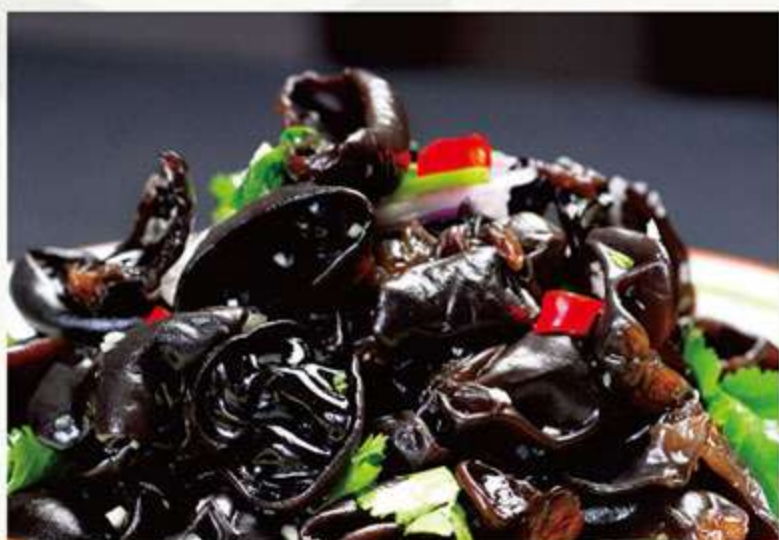
A10 爽口黑木耳 9.00 Black Fungus in Sour and Spicy Sauce