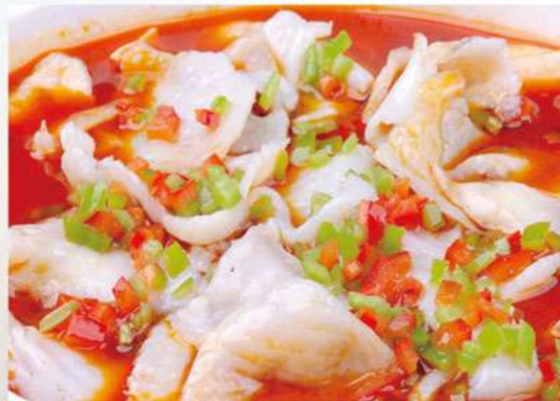
豆花牛/鱼/肥肠 🌶️ 20/19/20