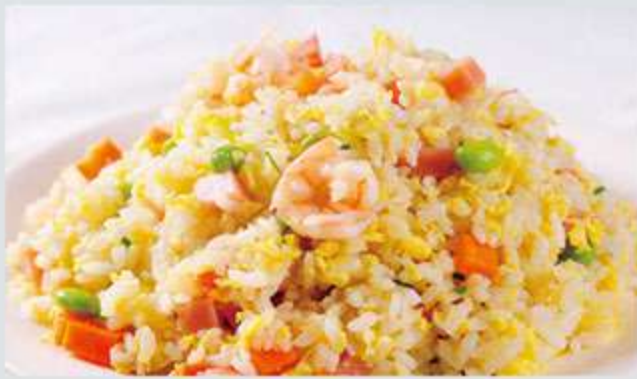
各式炒饭 13.00 Fired Rice Pork/Chicken/Beef/Shrimp/Vegetable