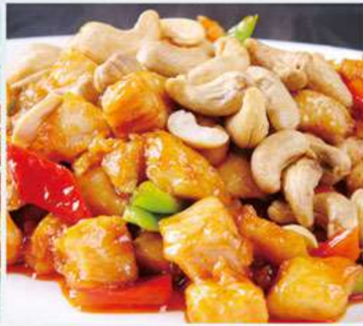
腰果鸡 17.00 Chicken with Cashew Nut