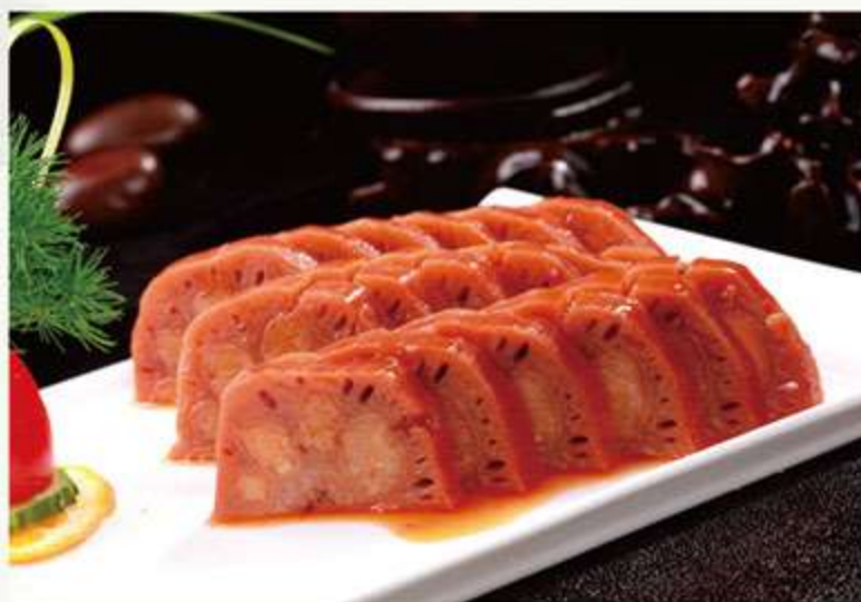
A7 桂花糯米藕 13.00 Glutinous Rice Lotus Root with Osmanthus Sauce