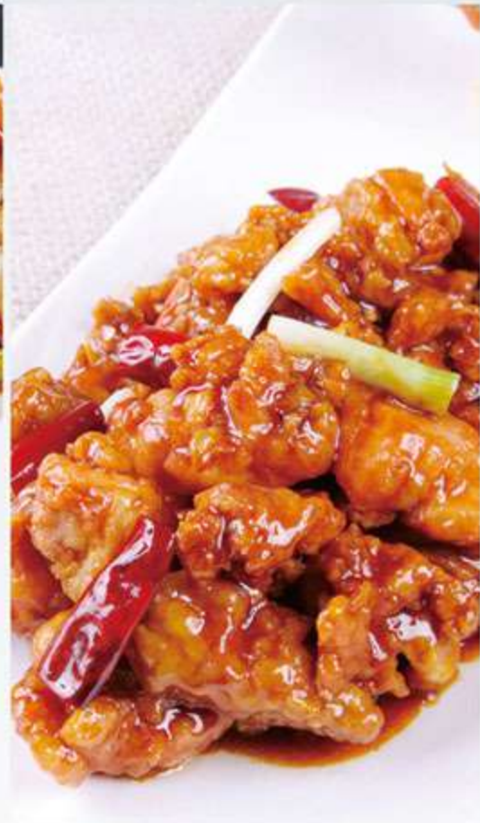
左宗鸡 17.00 ▶ General Tao's Chicken with Green, Red Pepper and Broccoli