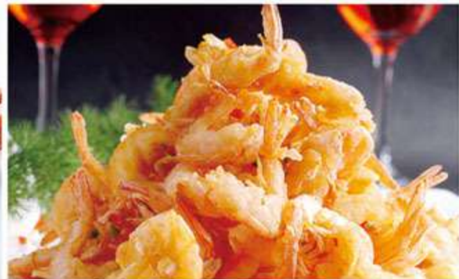
椒盐虾 (带壳) 22.00 Hot Peper Salt Shrimp