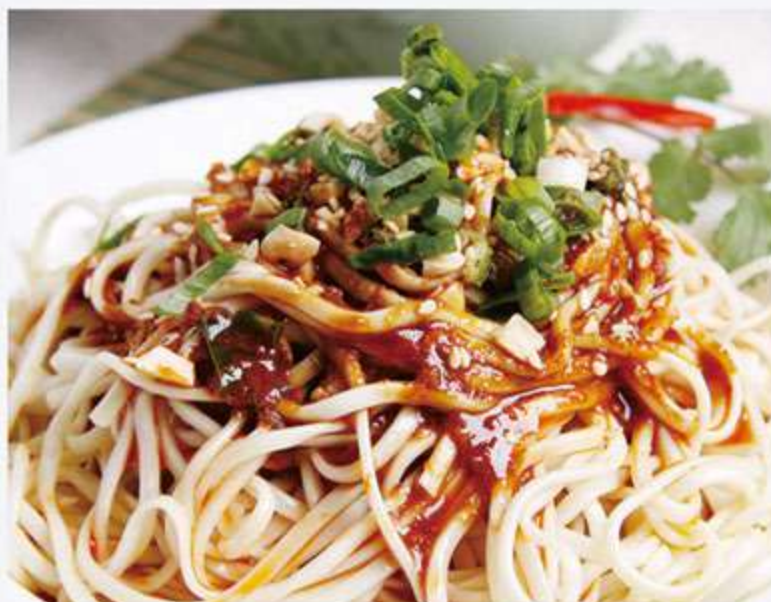
D11 旦旦面 9.00 Dan Dan Noodle with Minced Pork