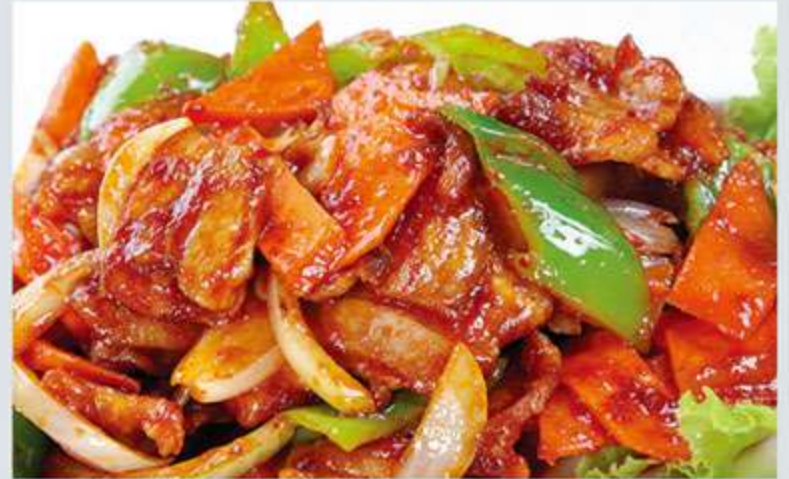
酱爆五花肉 18.00 Sauteed Pork in Authentic Chengdu Style