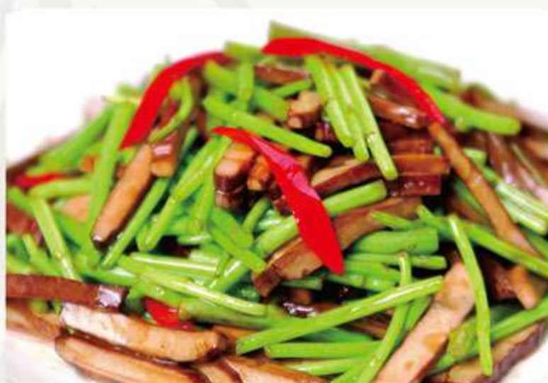
A11 芹菜香干 12.00 Celery Tofu Salad Chinese Tender Celery with Shredded Smoked Dry Tofu

任何事物过敏请提前通知我们 If you have any food allergy, please notify us 图片仅供参考，请以实物为准。The picture is for reference only. Please be subject to the actual products.