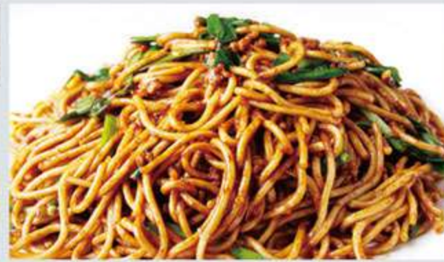
各式炒面 13.00 Lo Mein Pork/Chicken/Beef/Shrimp/Vegetable