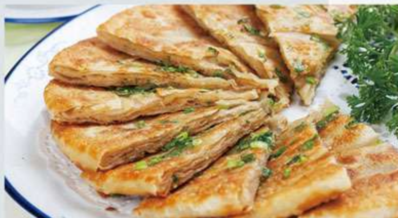
D8 葱油饼 6.00 Scallion Pancake