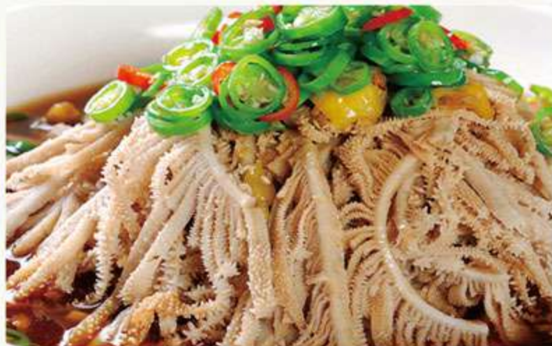
鲜椒草原肚 🌶️ 25.00 Soft Shelled Turtle with Green Pepper, Chinese Leave , Shredded Dry Tofu