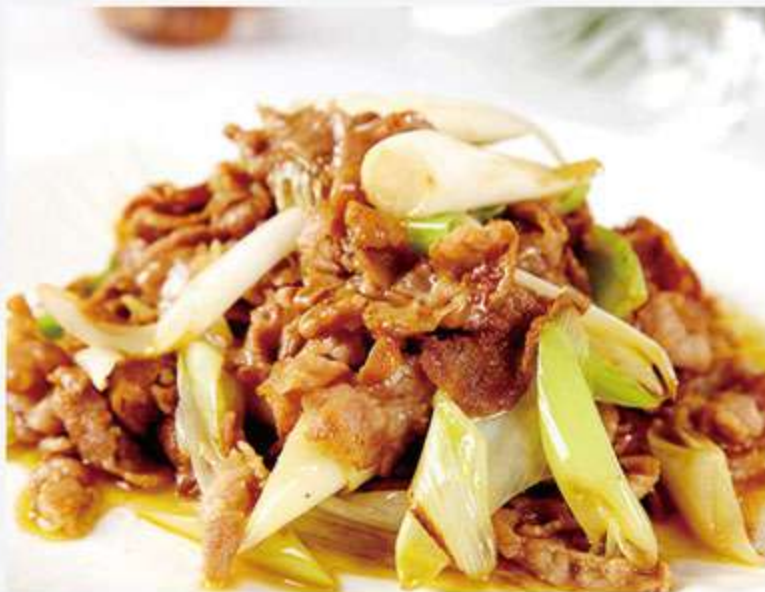
葱爆牛/羊 20/19 Stir Fried Green Onion Beef/Lamb