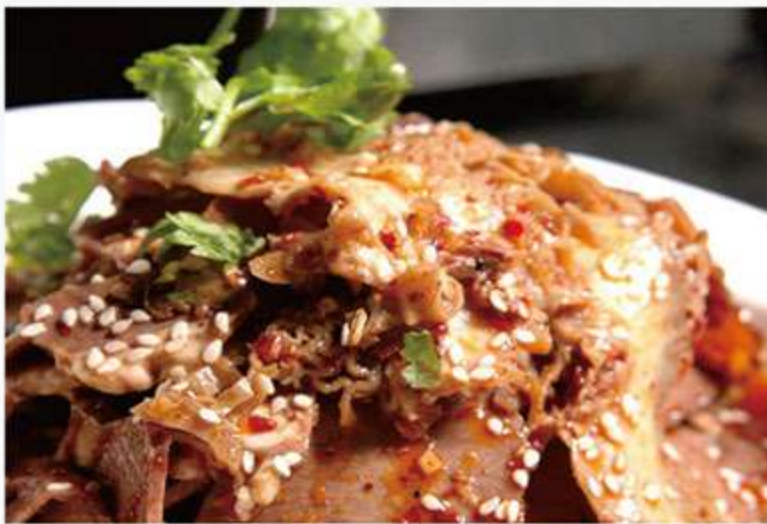
A2 夫妻肺片 🌶️🌶️ 15.00 Beef Tripe & Tongue In Chili Oil