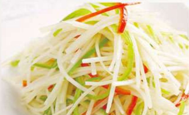
小炒土豆丝 13.00 Stir Fried Shredded Potato