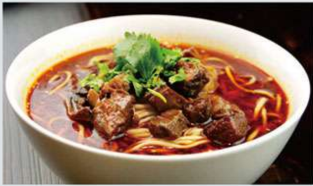
四川牛肉面 🌶️ 14.00 Sichuan Spicy Style Beef Noodle Soup