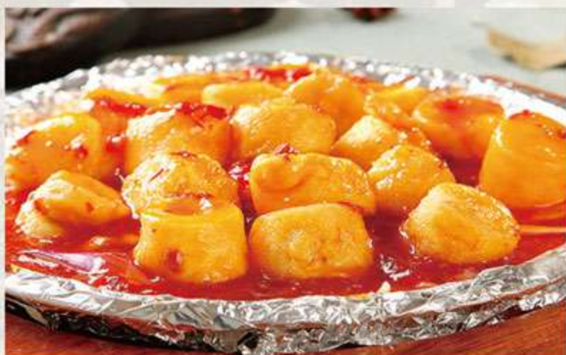
铁板玉子豆腐 20.00 Hibachi Tofu