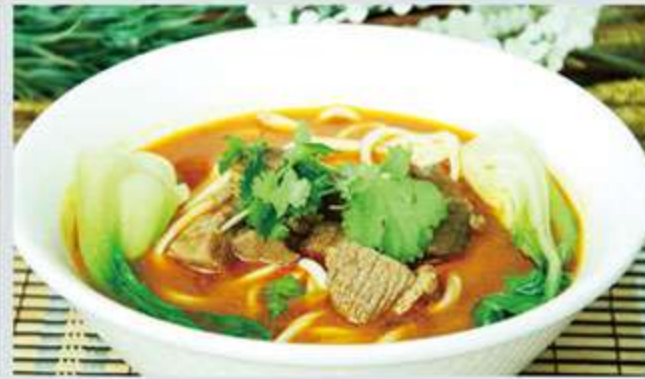
红烧牛肉面 14.00 Braised Beef Noodle Soup