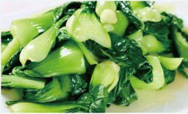
清炒上海苗 14.00 Sautéed Baby Bok Choy with Fresh Garlic