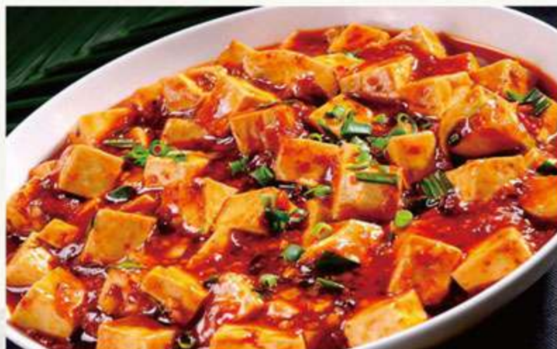
麻婆豆腐 🌶️ 15.00 Mapo Tofu Tofu w/ Minced Pork Garlic Shoot with Sichuan Red Chili