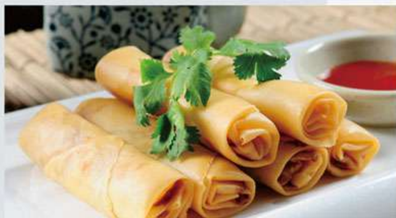
D10 春卷 6.00 Vegetable Spring Roll

任何事物过敏请提前通知我们 If you have any food allergy, please notify us 图片仅供参考, 请以实物为准。The picture is for reference only. Please be subject to the actual products.