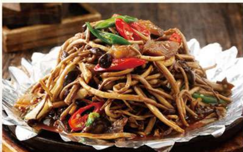
铁板茶树菇 22.00 Stir Fried Chinese Mushroom Served on Sizzling Iron Plate