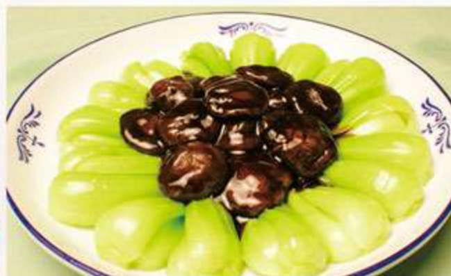
冬菇菜芯 18.00 Baby Bok Choy with Shiitake Mushroom