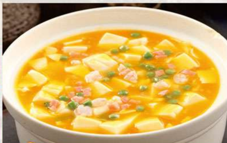
西施豆花 16.00 Soft Tofu Pudding with Salty Egg Yolk and Spam Hibachi Tofu with Minced Pork, Onion, Garlic with Chef Special Sauce