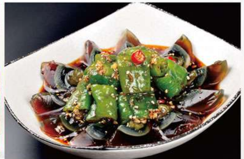
A5 烧椒皮蛋 🌶️ 11.00 Ugly Thousand Year Egg w/ Stewed Pepper

任何事物过敏请提前通知我们 If you have any food allergy, please notify us 图片仅供参考, 请以实物为准。The picture is for reference only. Please be subject to the actual products.