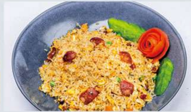
四川腊肠炒饭 14.00 Sichuan Sausage Fried Rice