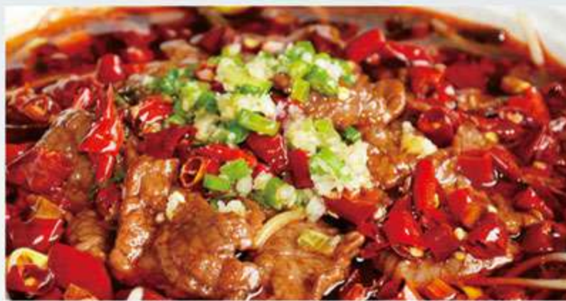
水煮牛肉/鱼片 🌶️ 21.00

Sauteed Frog with Chili Sauce, Cucumber, Oyster Mushroom, Fungus, Yuba, Bok Choy