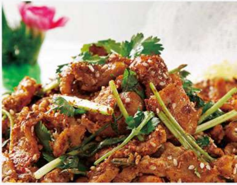
孜然羊肉/牛肉 19/20 Cumin Lamb / Beef